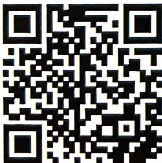
BP Correct for iOS

Click on the gear icon and then "Share readings with a practice." Then choose our practice.