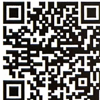
BP Correct for Android